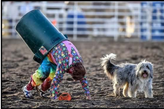
Special Needs Rodeo (Saturday 10:00 am)