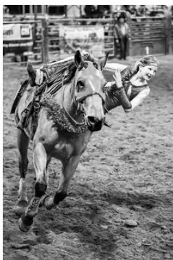
Special Needs Rodeo (Saturday 10:00 am)