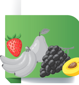
2 in 5 Kansans consumed fruit less than once per day