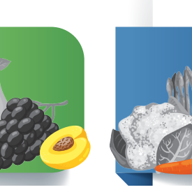
1 in 5 Kansans consumed vegetables less than once per day