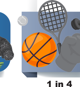
Kansas adults are physically inactive